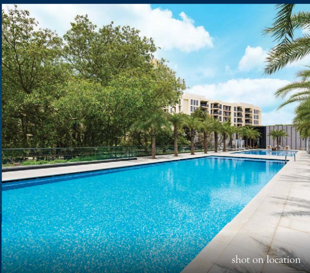
Take a lap of luxury with the outdoor and indoor pools to choose from