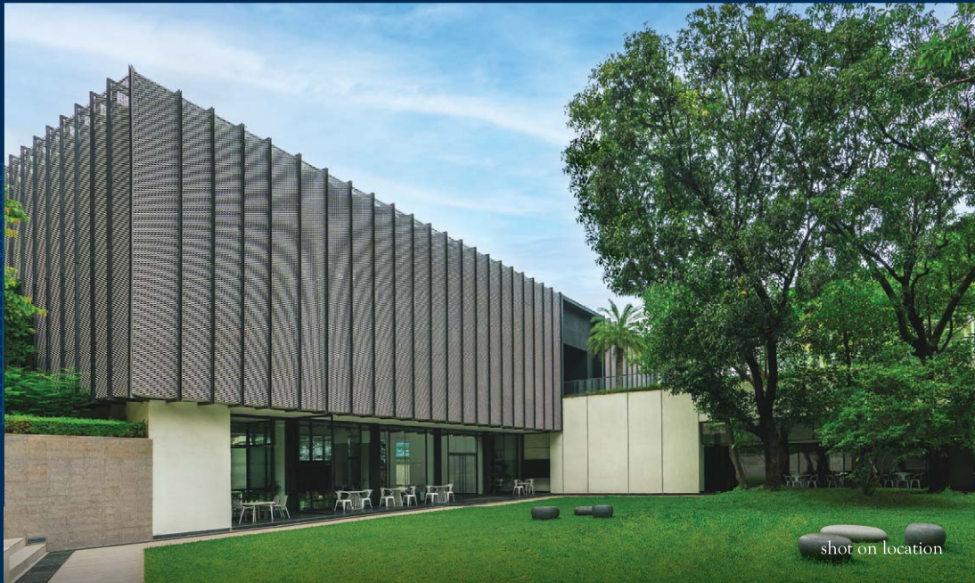
The Crown - internationally acclaimed, grand clubhouse