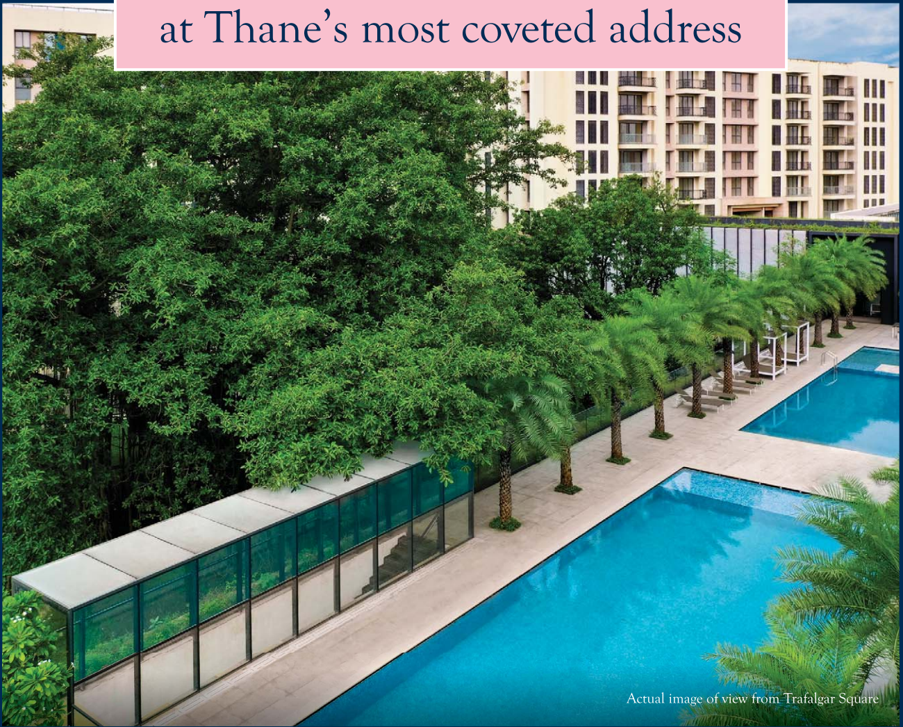
Actual image of view from Trafalgar Square

Experience regal London living at Thane's most coveted address