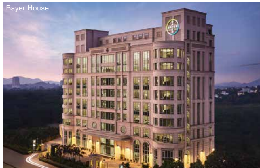
Actual image of Hiranandani Estate, Thane