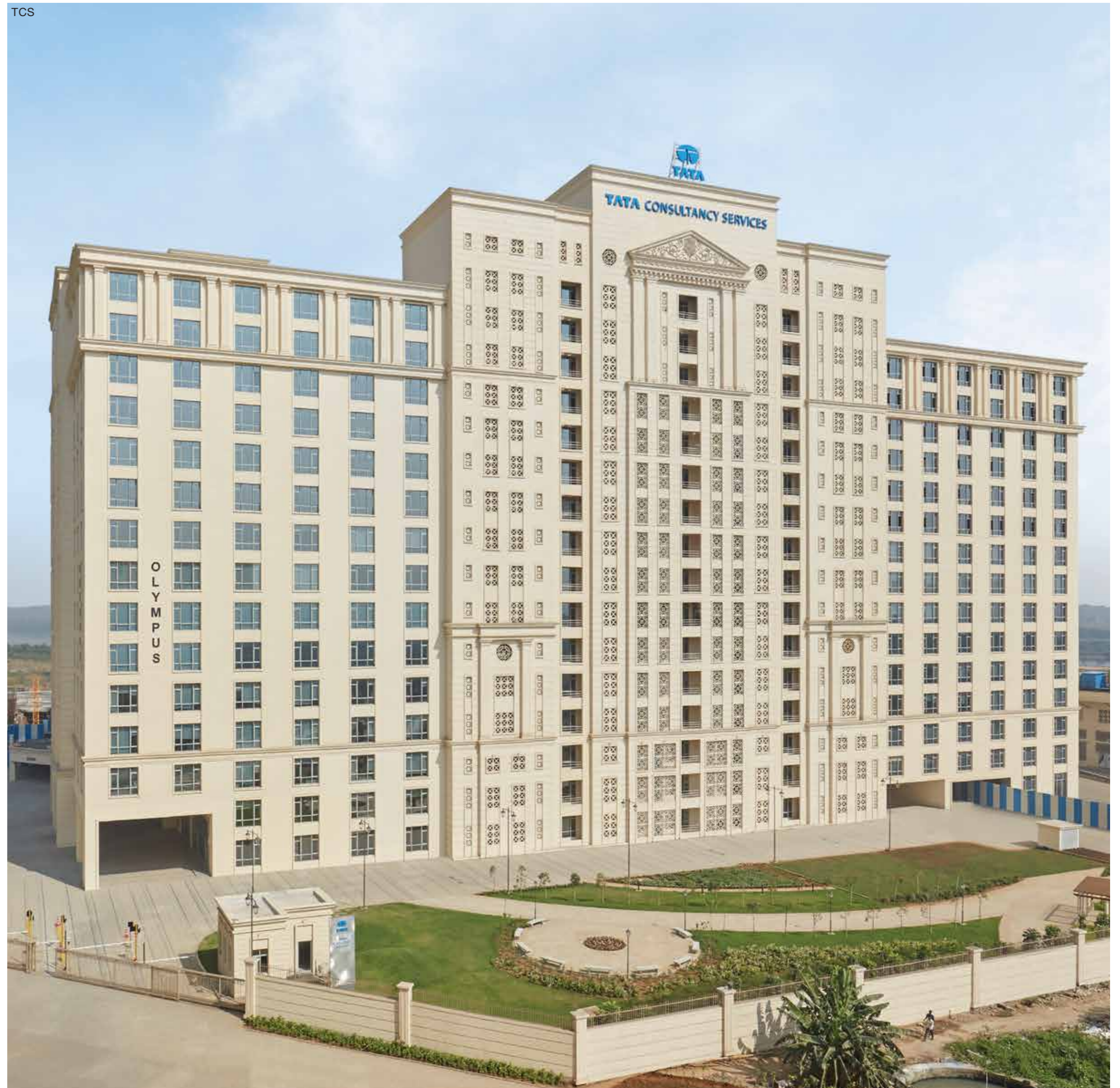
Actual image of Hiranandani Estate, Thane.