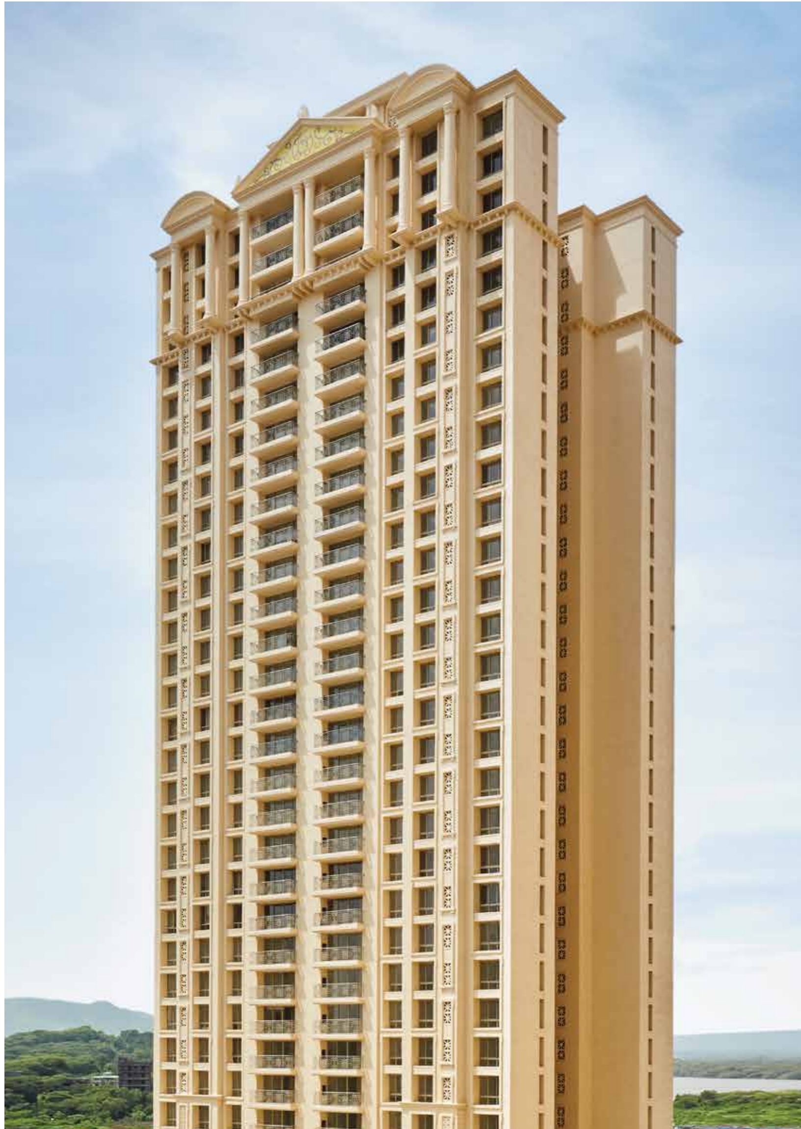
Actual image of Phillipa Building

Rediscover the grandeur in community living.