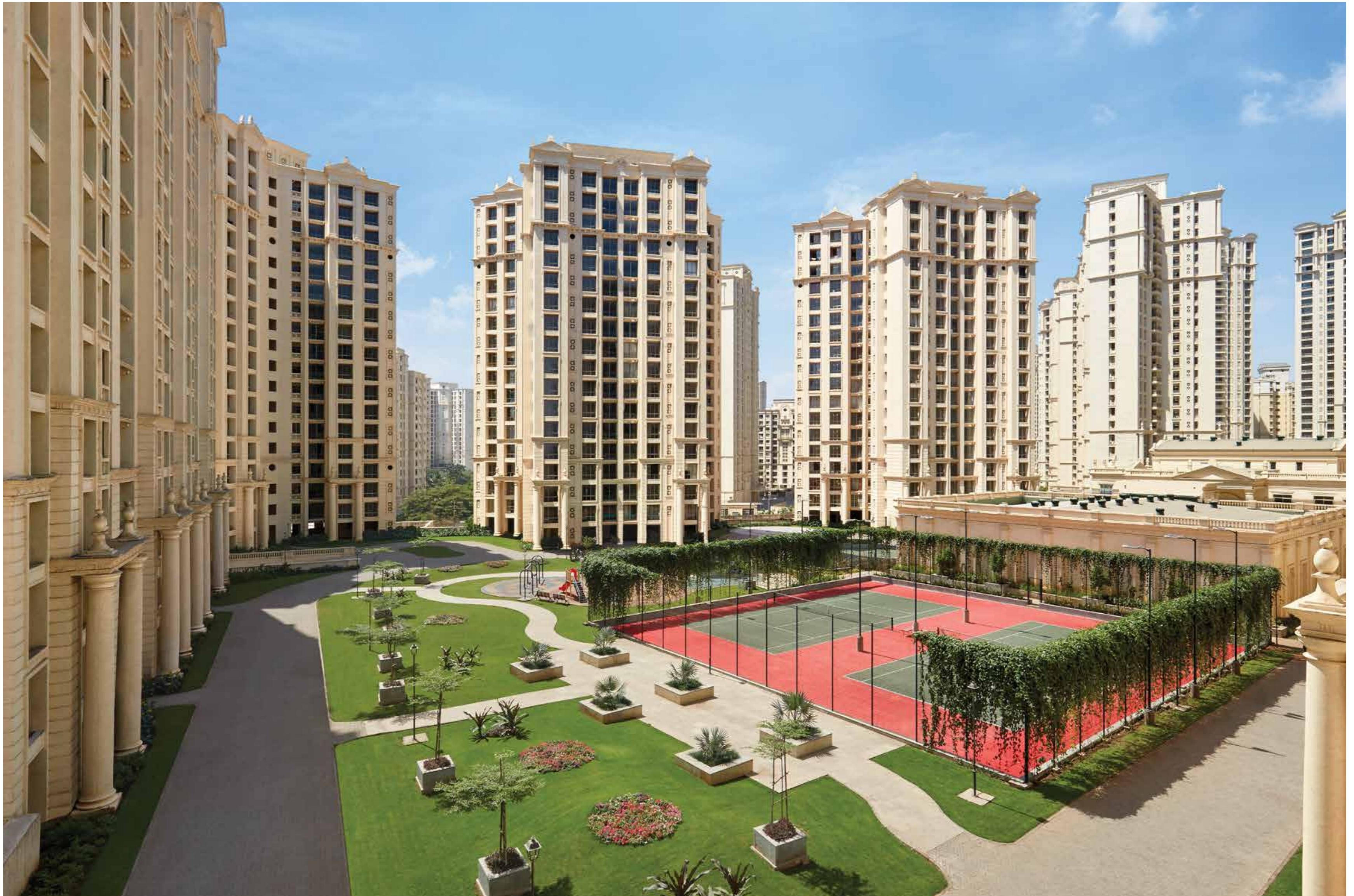
Actual image of Rodas Enclave, Hiranandani Estate, Thane.