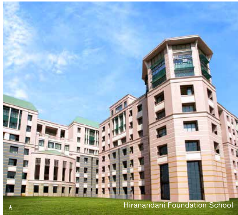
Hiranandani Foundation School