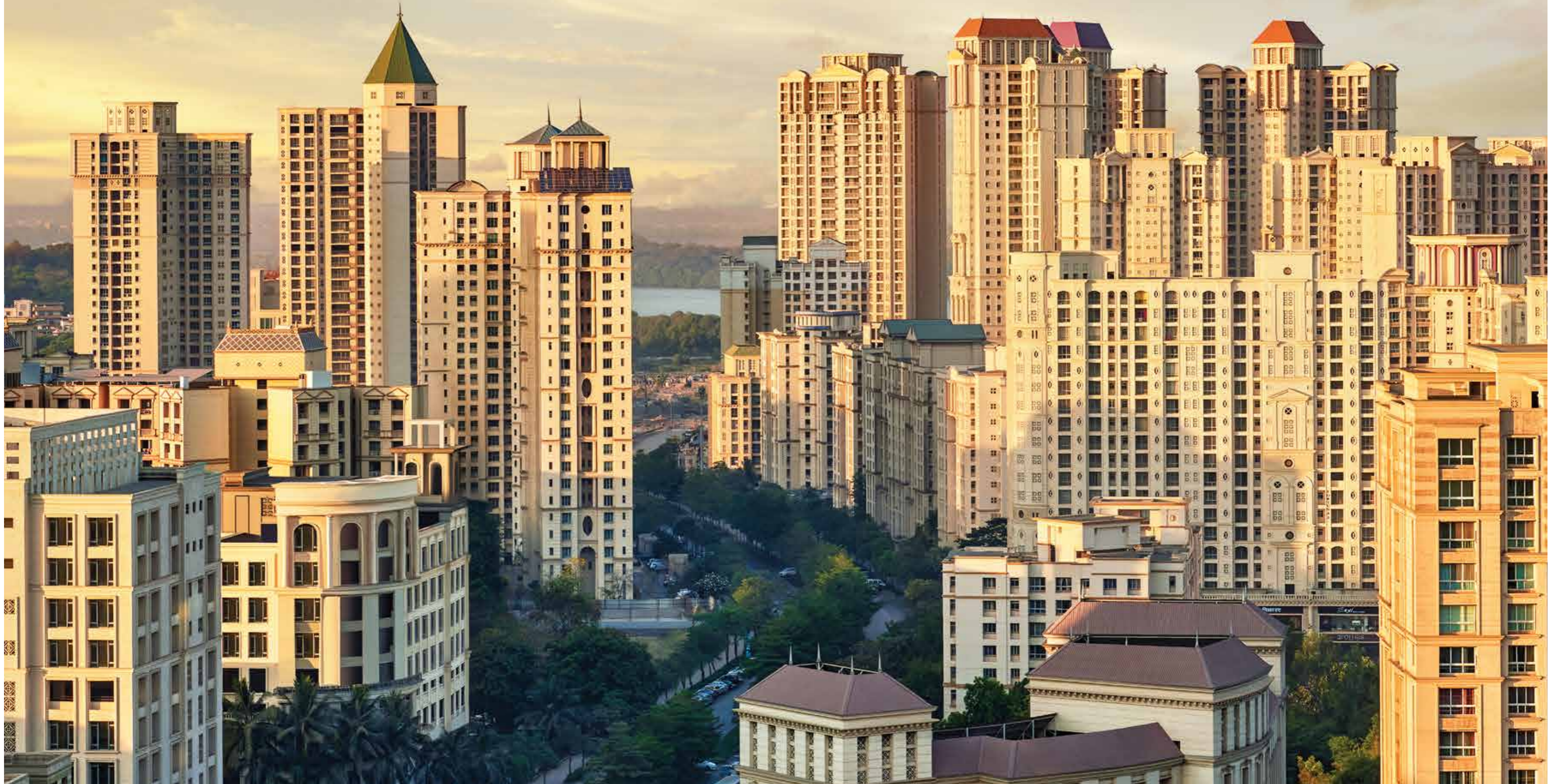
Actual image of Hiranandani Estate, Thane.

Hiranandani Estate, the name that has transformed over a million dreams into reality, spans across an enormous stretch of 250+ acres. It's a name that has factually given meaning to the word 'community living' in Thane. With uncountable joyous faces and satisfied families living amidst a green belt adorned with brilliant architectures and recreational amenities, Hiranandani Estate, turns out to be an abode for every dream.