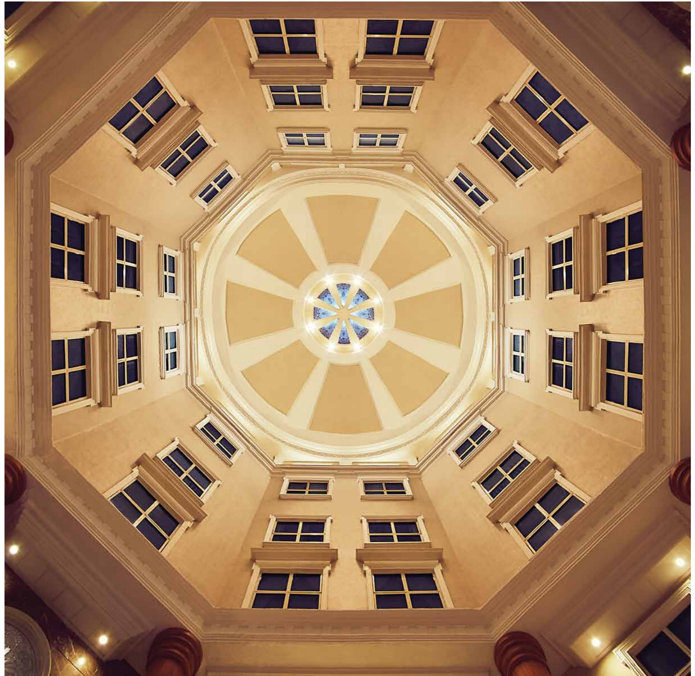
Interior image of Olympia, Hiranandani Gardens, Powai.

Every Hiranandani township reflects this commitment to raising a complete world that looks into all aspects of living. Diverse ventures come together to create an integrated experience, minutely balancing all areas of happiness. An eco-friendly ambience, convenient infrastructure, luxurious lifestyle and proximity to work are seamlessly incorporated together, adding depth and joy to daily life.